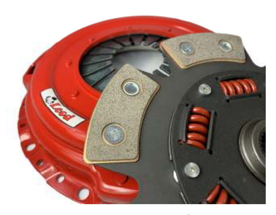
Street Power 761031 Shown